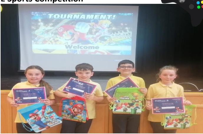
A team of our Primary 6's had a fabulous day at St Mary's College attending their first E-Sports Competition. The children really enjoyed their day and look forward to many more events like this! Thank you for having us 😣